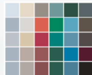
Exterior Colour Options

Whether you're in the market for an industrial workspace or a comfortable home environment, the EXO™ Building System can be configured to meet your requirements.